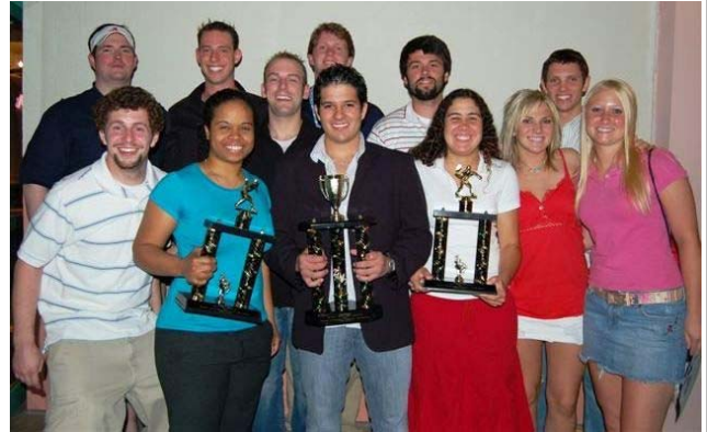
University of Alabama Overall Team Champs

The University of Alabama repeated its 2005 performance by winning the overall team championships at the 2007 35th USA Racquetball National Intercollegiate Championships in Tempe, Arizona. Perhaps the most surprising result was the victory by Arizona State University in the women's team championship. Although the #1 player from Arizona lost early in the tournament, the well-balanced team placed in all of the remaining women's divisions.