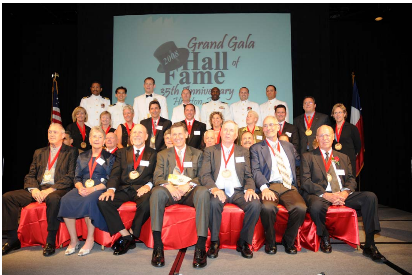
USA Racquetball Hall of Fame Members With the US Navy